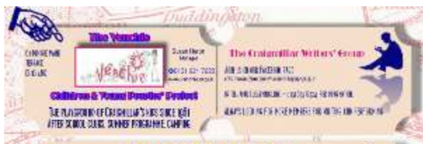
Showing 2 of four in illustration.

Only £35 with 15 free calendars Only 4 available. Please note this will incur additional charges (£10) if art work to be provided and approved. Copy provided by client.